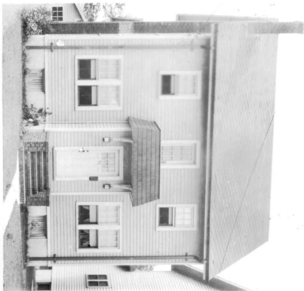
BOARD OF REALTORS of the ORANGES & MAPLEWOOD